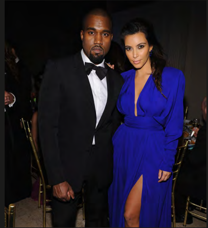
Kanye West & Kim Kardashian West

223,884,834+ media impressions Entertainment Tonight, E! News, EXTRA