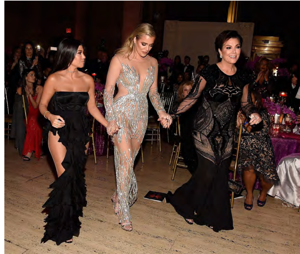
Kourtney Kardashian, Khloe Kardashian and Kris Jenner