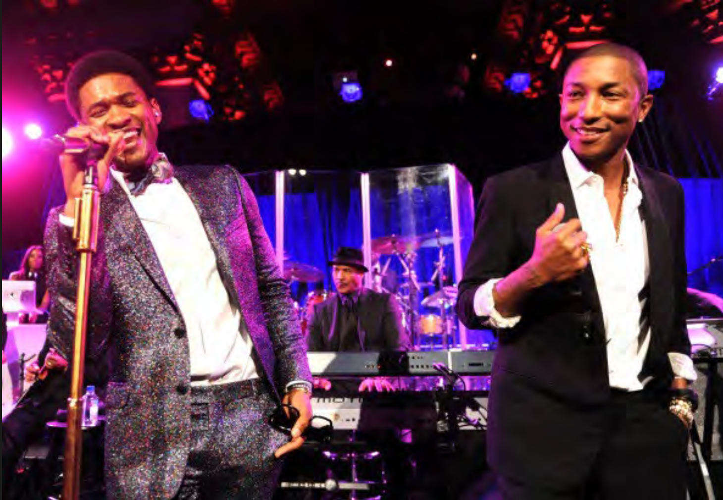
Usher and Pharrell Williams