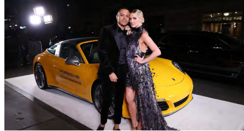
Evan Ross and Ashlee Simpson

The Angel Ball is a high energy charity event featuring spectacular performers and presenters! The Gala attracts a global audience of prominent, high-net-worth supporters, celebrities, influencers, executives and philanthropists.