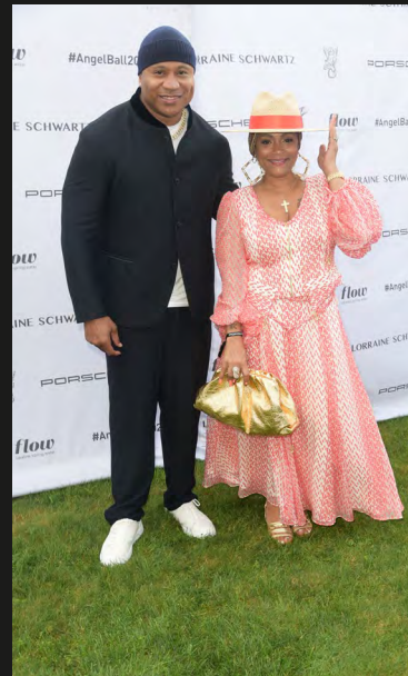
LL Cool J & Simone I. Smith